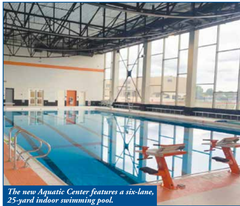
The new Aquatic Center features a six-lane, 25-yard indoor swimming pool.