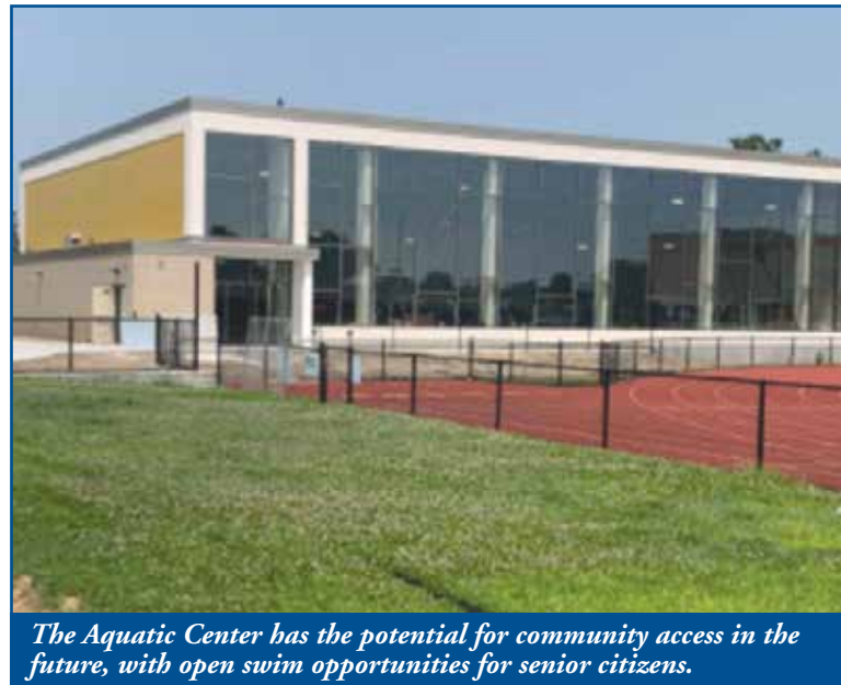
The Aquatic Center has the potential for community access in the future, with open swim opportunities for senior citizens.