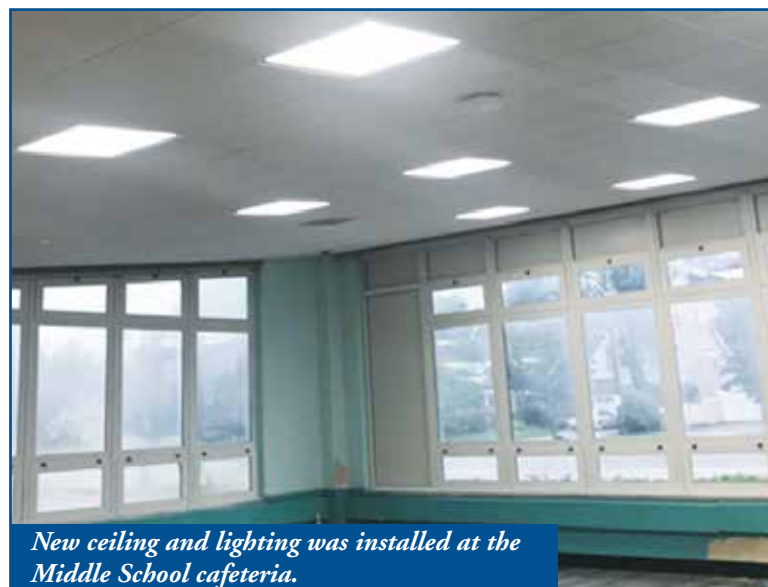
New ceiling and lighting was installed at the Middle School cafeteria.