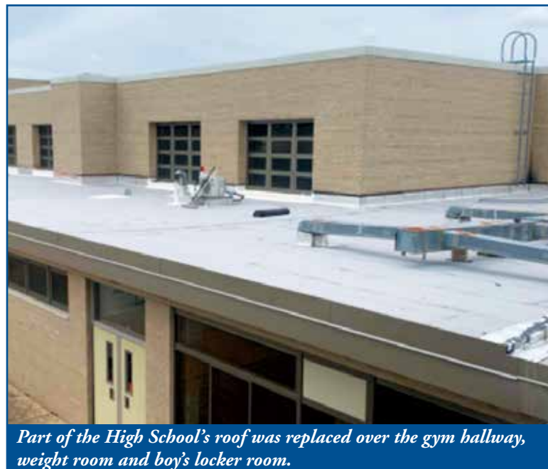
Part of the High School's roof was replaced over the gym hallway, weight room and boy's locker room.