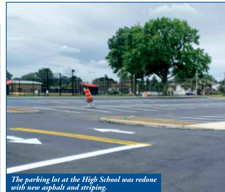
The parking lot at the High School was redone with new asphalt and striping.