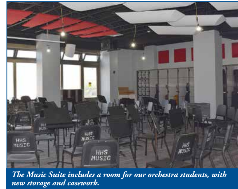
The Music Suite includes a room for our orchestra students, with new storage and casework.