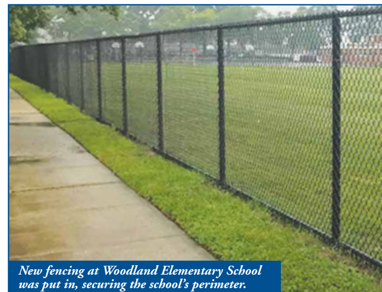
New fencing at Woodland Elementary School was put in, securing the school's perimeter.