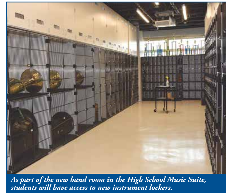
As part of the new band room in the High School Music Suite, students will have access to new instrument lockers.